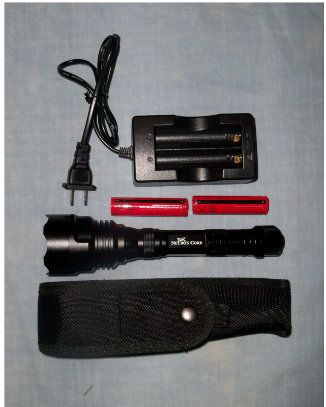
Inclusive package: S-1300 Searchlight™, cordura holster, ultra high capacity rechargeable Li-ion batteries and battery recharger.